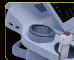
Considerate gel warmer design for better experience