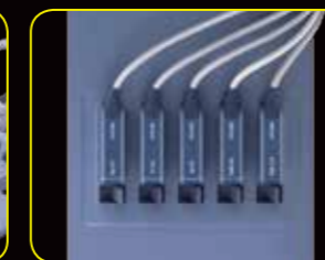
5 active transducer ports to maximize clinical application