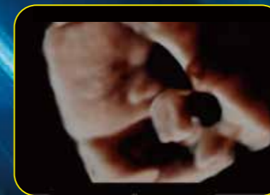
Fetal Face (eLive)