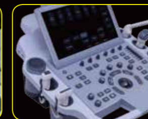
Customizable touch screen user panel to simplify diagnosis