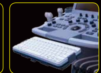
Keyboard with dedicated swivel for easy folding