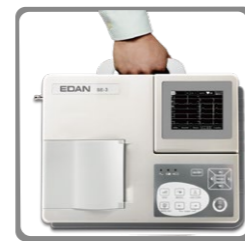
Portable Design (Handle Optional)