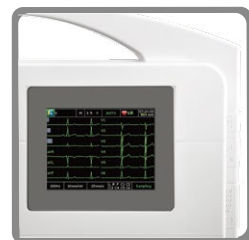
12-lead Waveforms Display