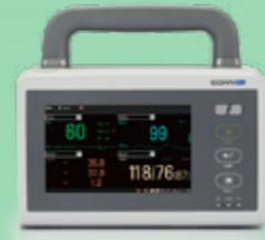
iM20 Patient Monitor